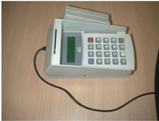
Normal terminal connection cable