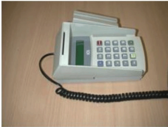
Changed cable houses additional wires to capture CHD